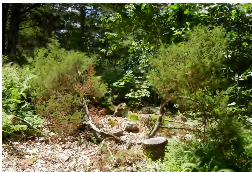
Fig. 10. var. depressa , note 2 upright stems, Cushman, MA